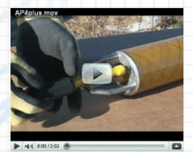
See the AP4+ disassembled in two minutes with this video online: http://www.qedenv.com/AP4plus