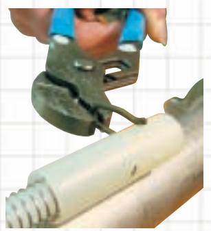
Removing the spring clip allows for easy disassembly of the float.